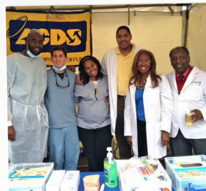
HOPE FOR LIFE HEALTH FORUM