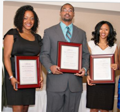
2011 SCHOLARSHIP RECIPIENTS