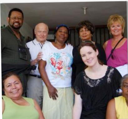
HAITI MISSION UPDATE